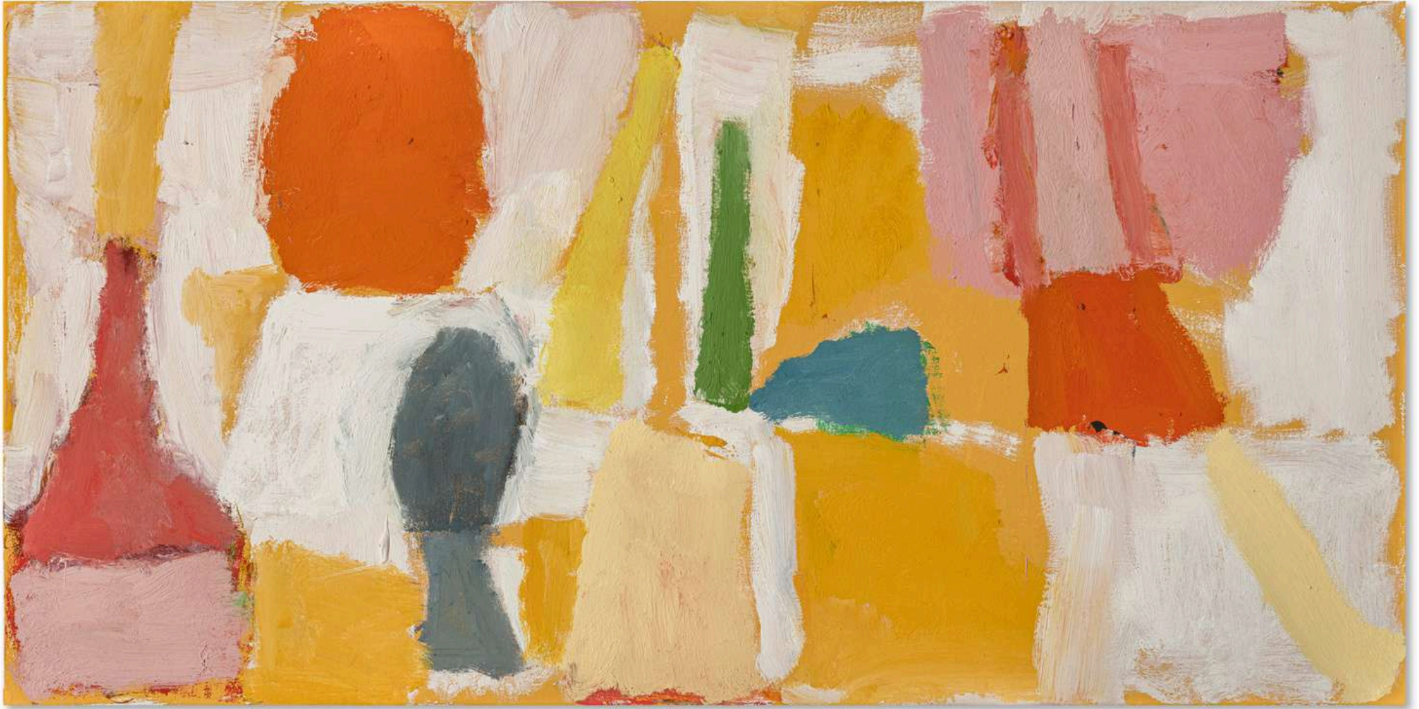
Pastorale (Angelico) II 2025