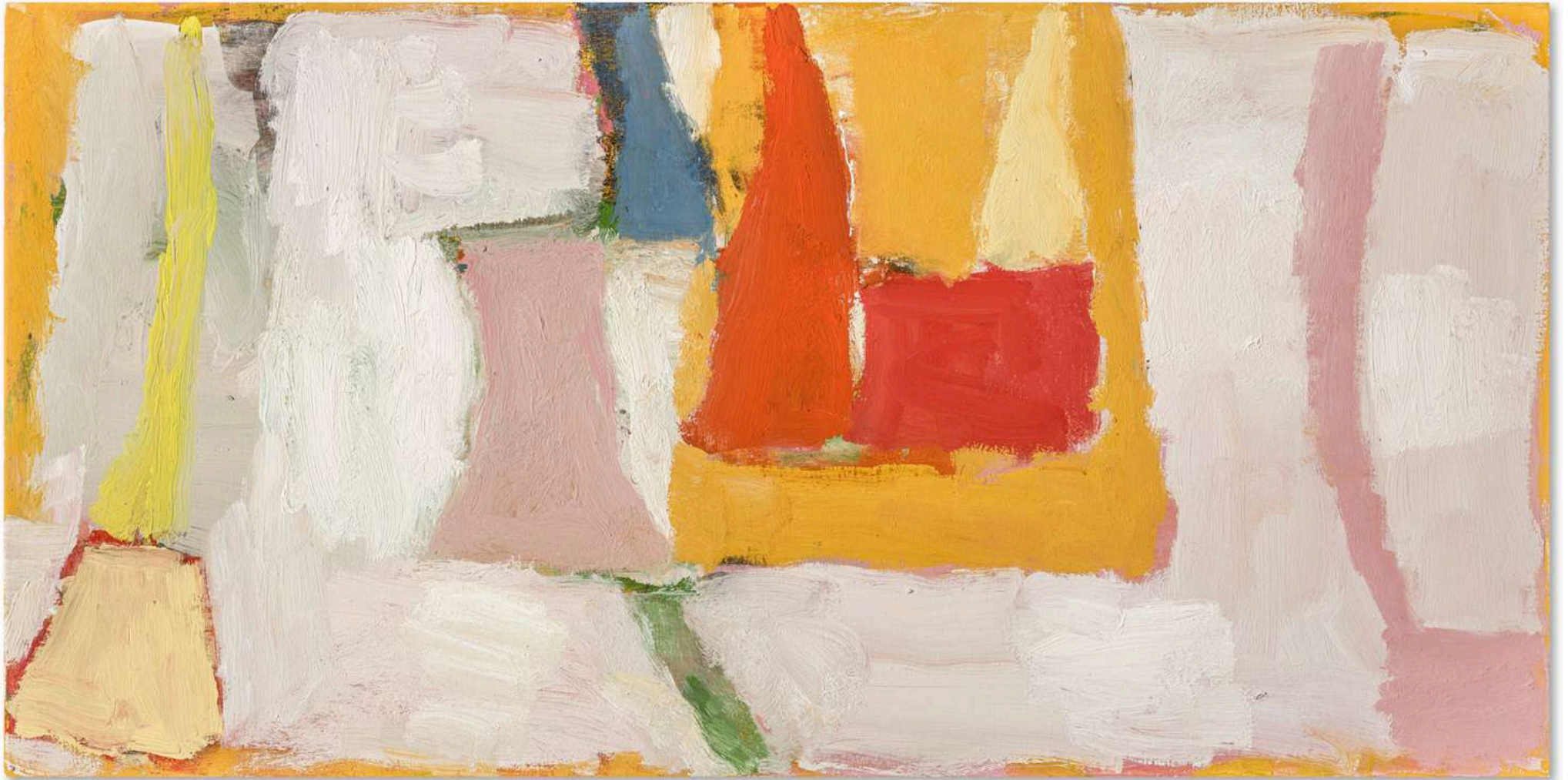
Pastorale (Angelico) I 2025