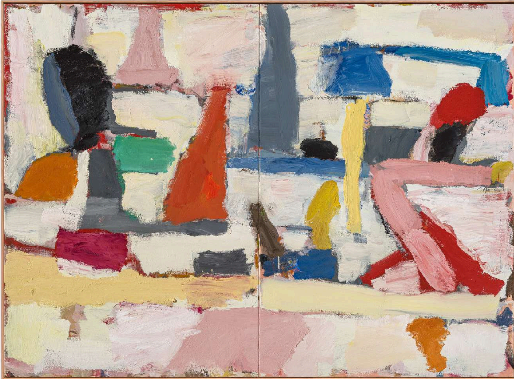
Forum 2025 oil on canvas 110 x 147.5 cm $14,500 framed