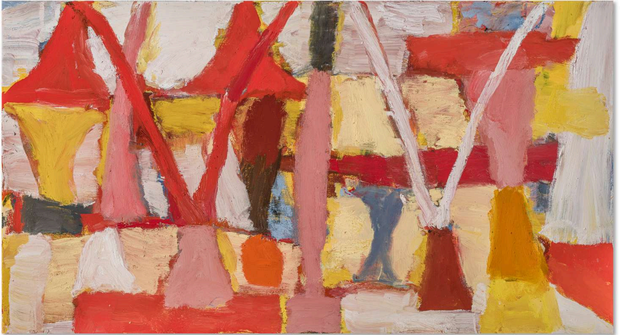
The Forest 2025 oil on canvas 61.5 x 112 cm $9,000