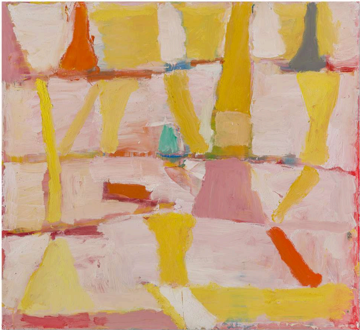
Early Morning 2025 oil on canvas 111.5 x 122 cm $13,000