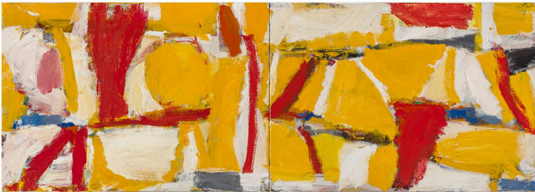
Sunny Day 2025 oil on canvas 61 x 174 cm $10,500