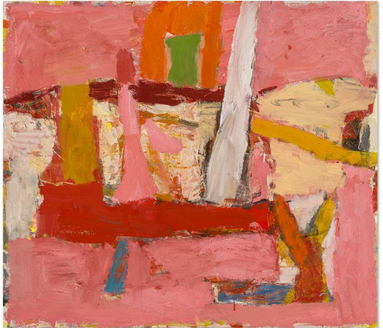
After Snow, Pink Glow 2025 oil on canvas 107 x 122 cm $13,000