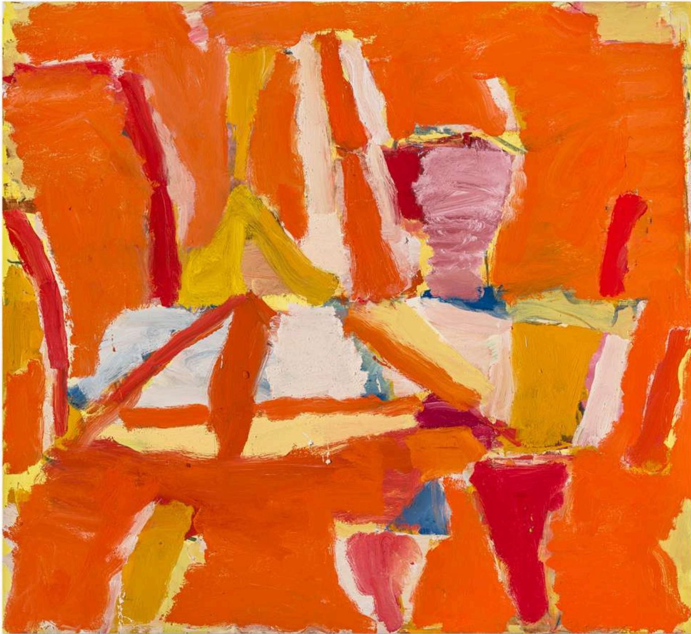
Sunset 2025 oil on canvas 111.5 x 122 cm $13,000