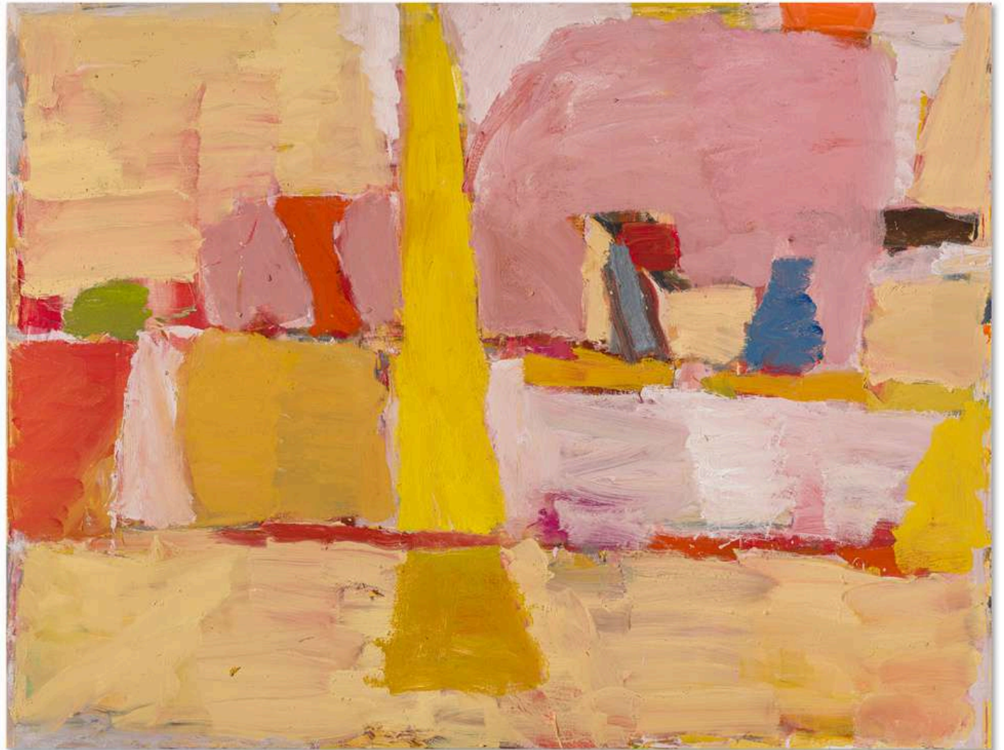
Pink Mountain with Ochre 2025 oil on canvas 112 x 143 cm $13,800