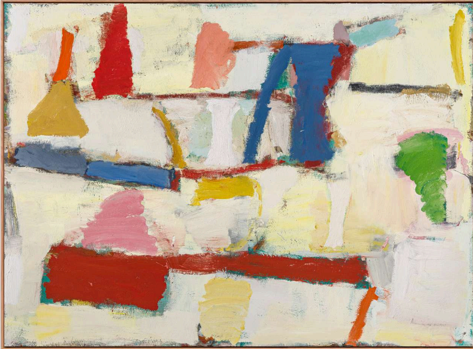
Arena II 2025 oil on canvas 138 x 183 cm $19,000 framed