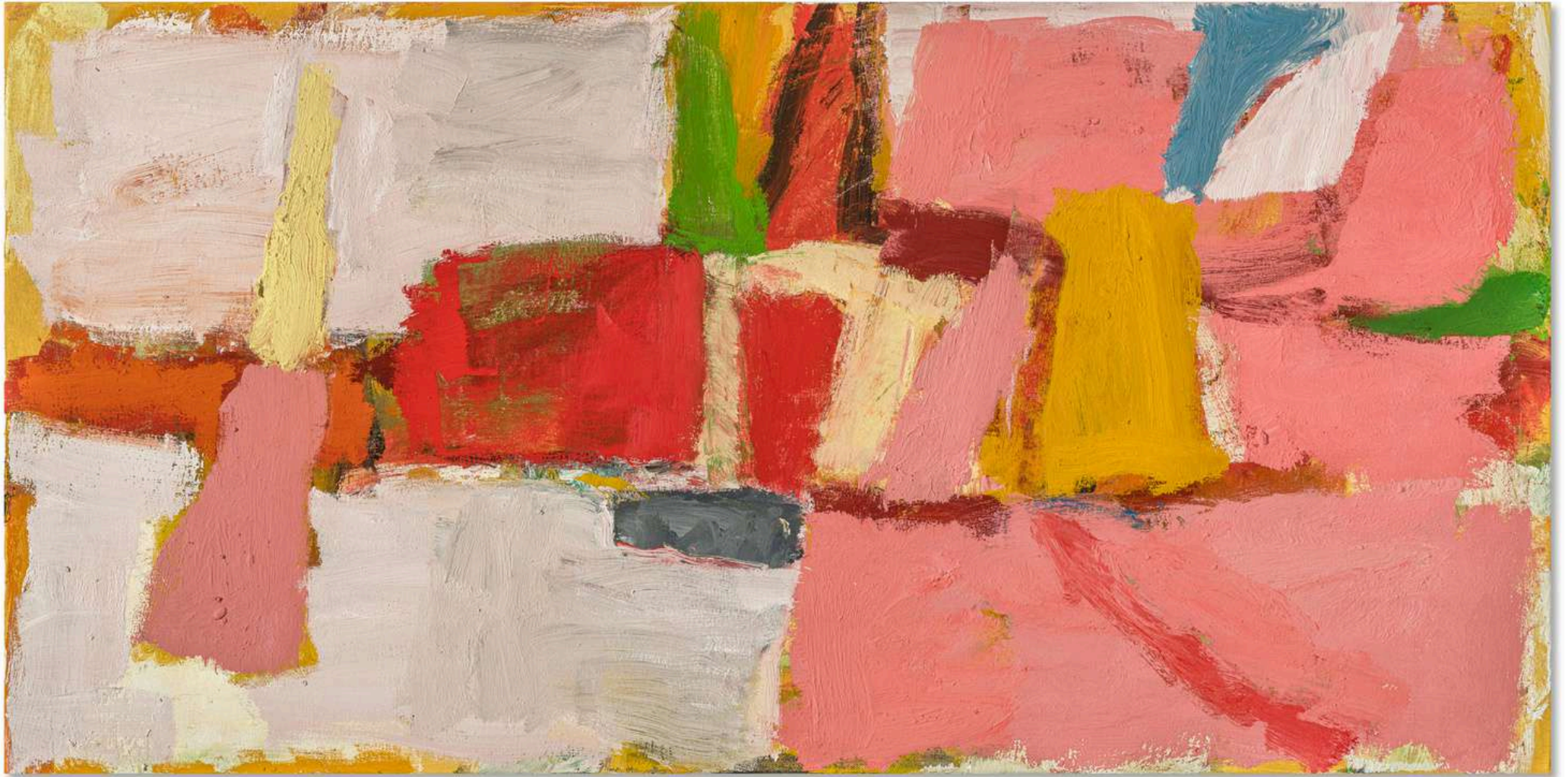
Villa (Angelico) 2025 oil on canvas 51 x 102 cm $8,500