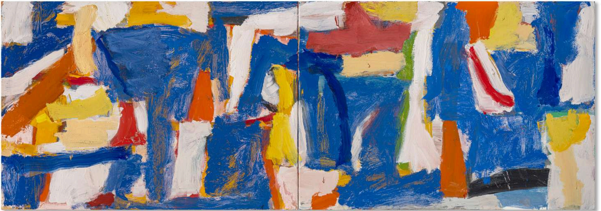
Land and Sea 2025 oil on canvas 61 x 174 cm $10,500