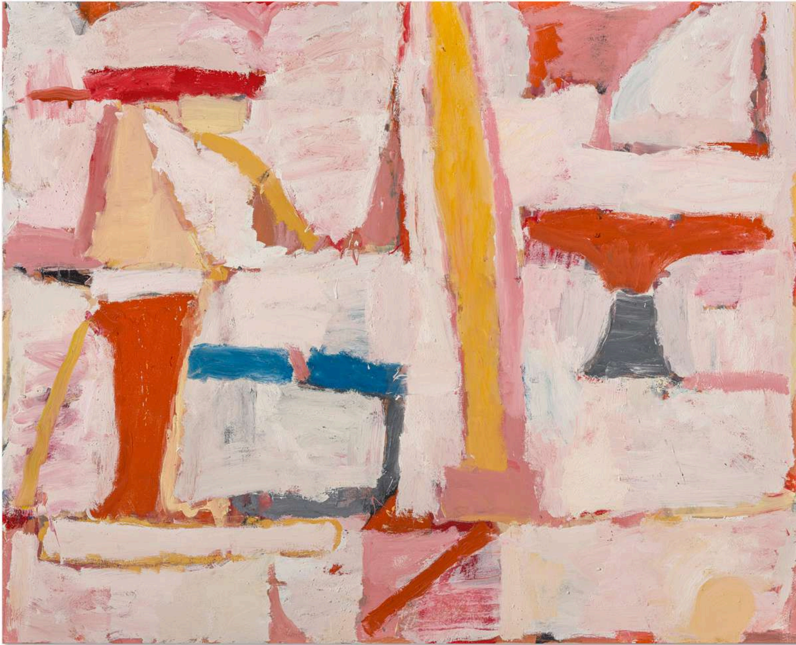
Lunar Landscape 2025 oil on canvas 147 x 183 cm $19,000