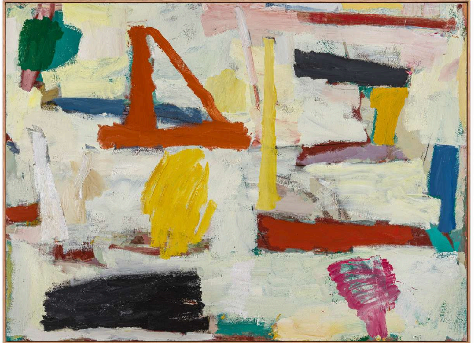
Arena 2025 oil on canvas 138 x 183 cm $19,000 framed