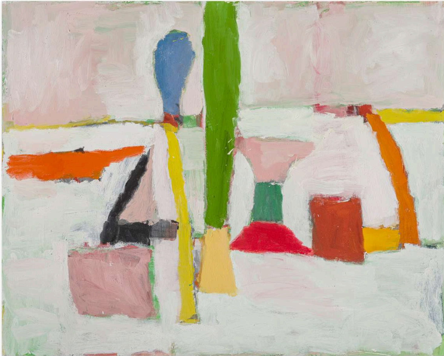
Arena III 2025 oil on canvas 120 x 150 cm $16,000