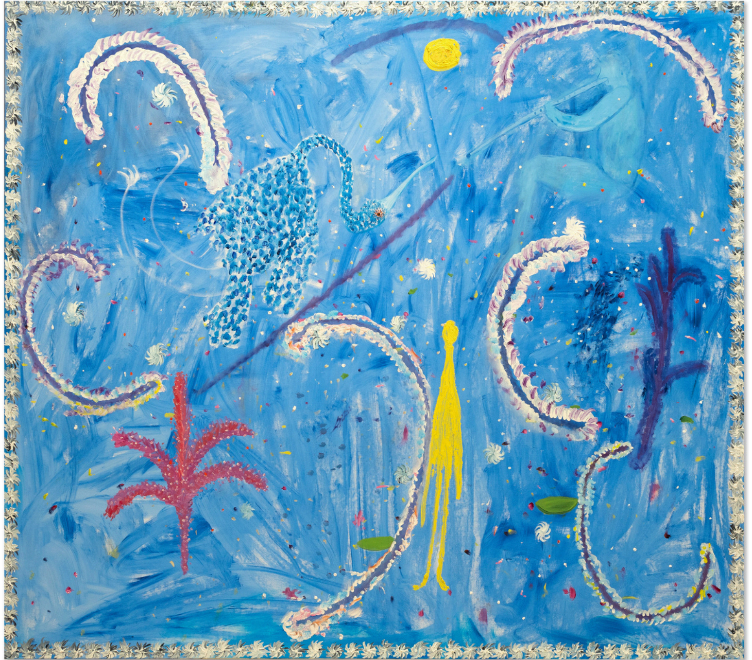
Moon on the water meets the Wind in September 2025 oil on cotton 160 x 180 cm $11,200