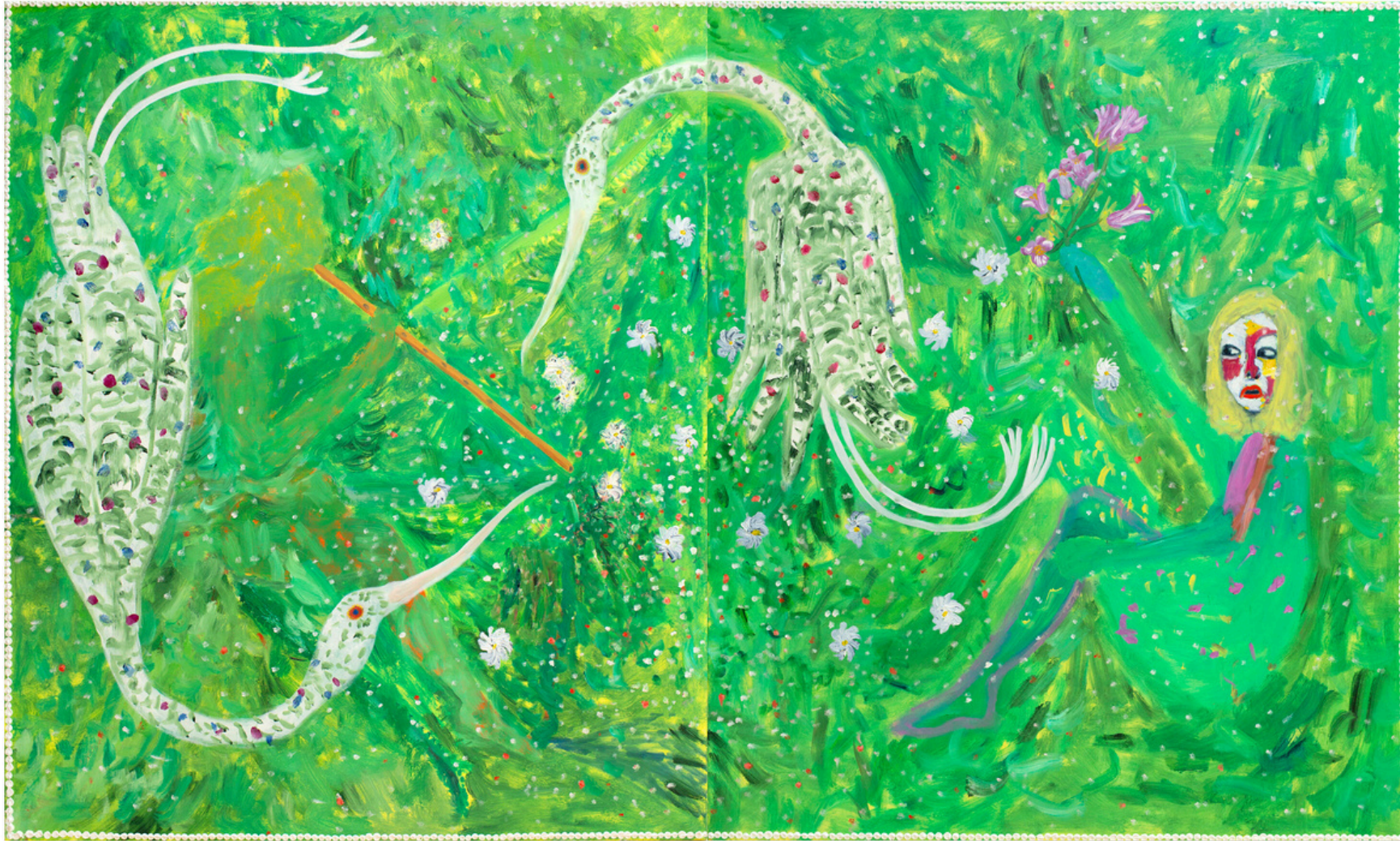
Invitation to the Wind (Diptych) 2025 oil on cotton 120 x 200 cm $10,400