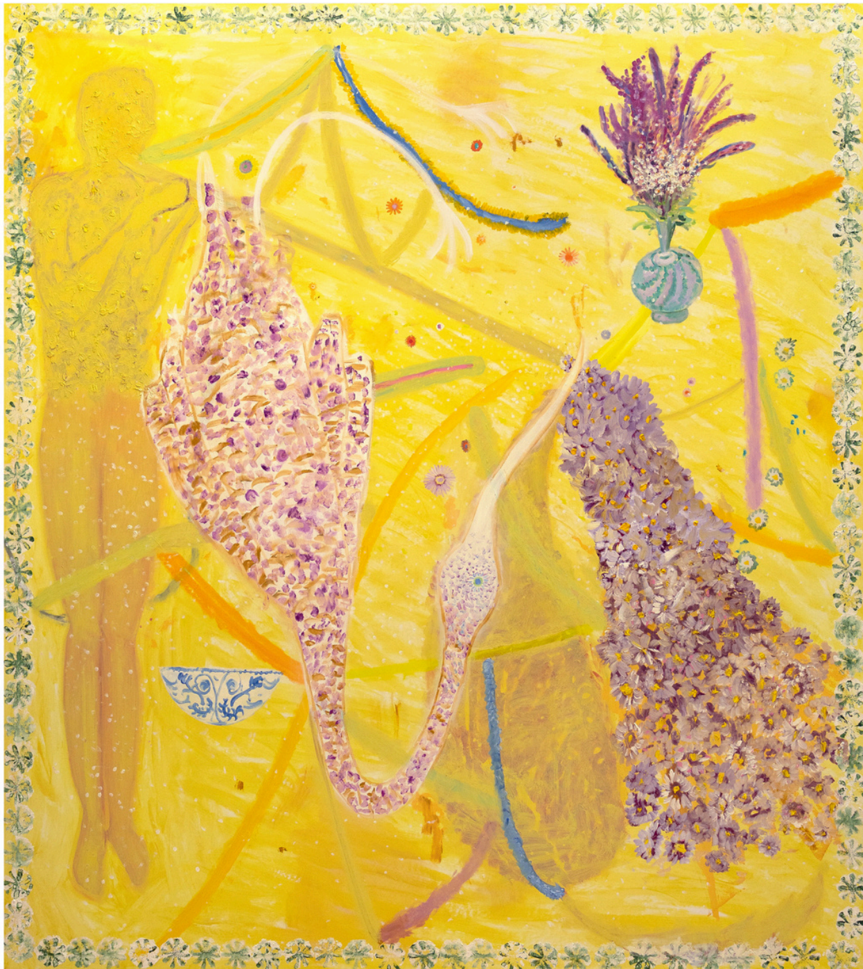
Lavender Fills the Bowl 2025