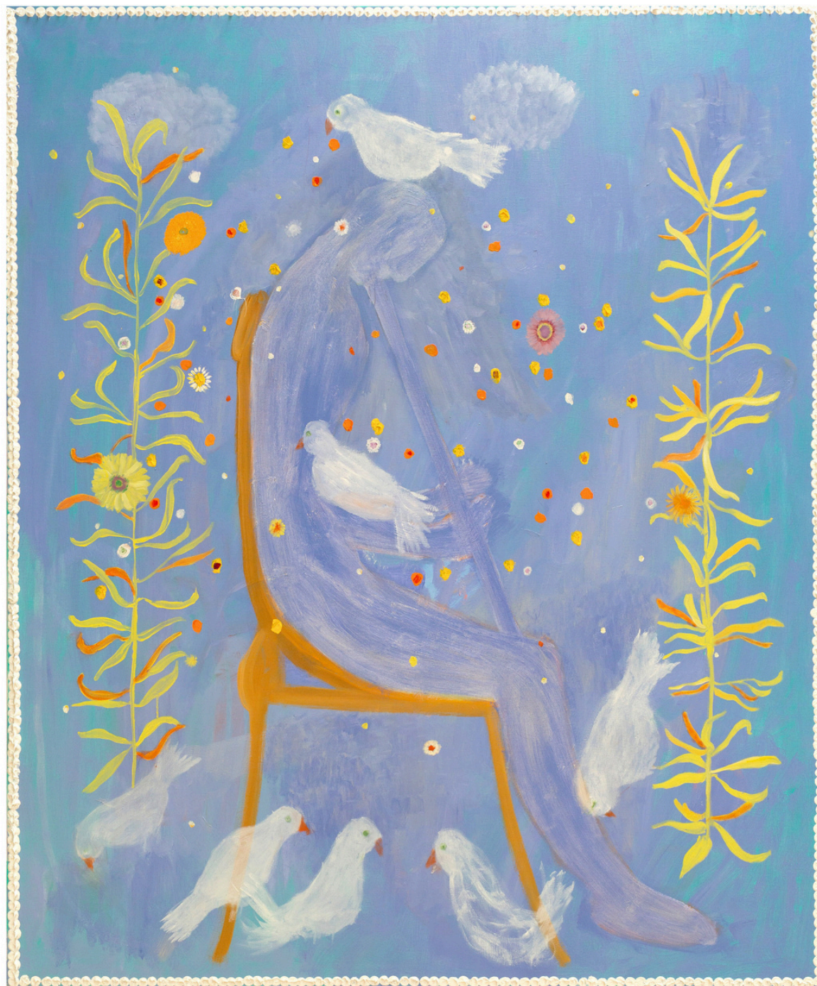
Flutist, Flock and Flowers for Growth 2025 oil on cotton 120 x 100 cm $5,800