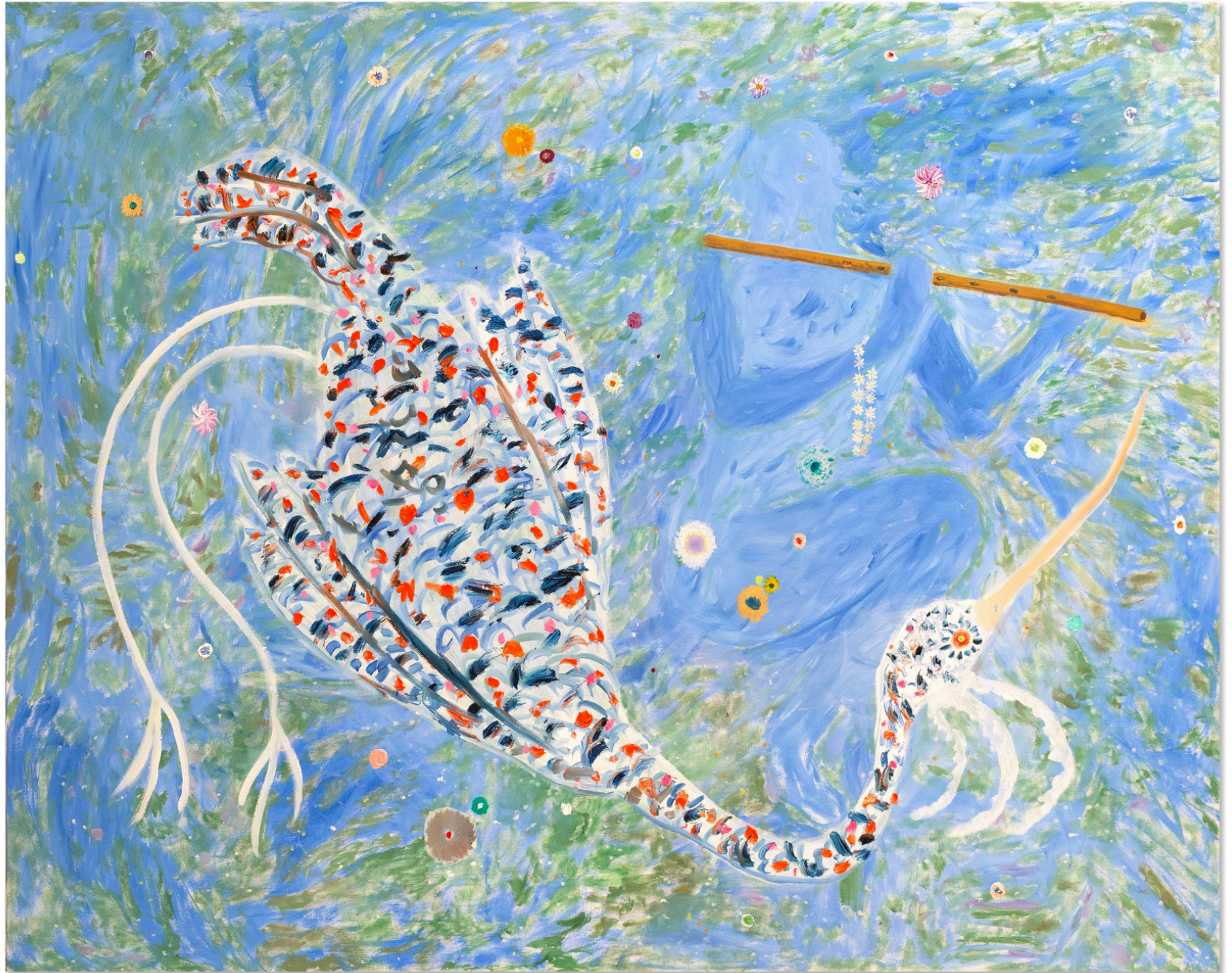
Zephyr on the Water 2025 oil on cotton 120 x 150 cm $7,500