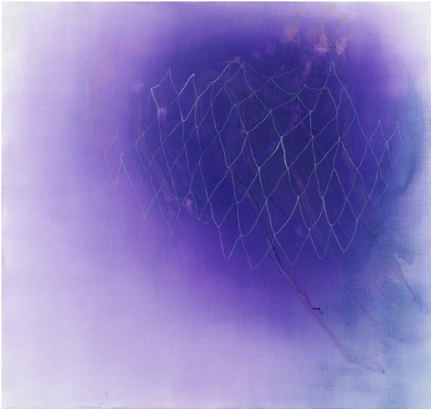
'Envelop' 2016 mixed media on linen 97 x 92 cm $5,500 framed