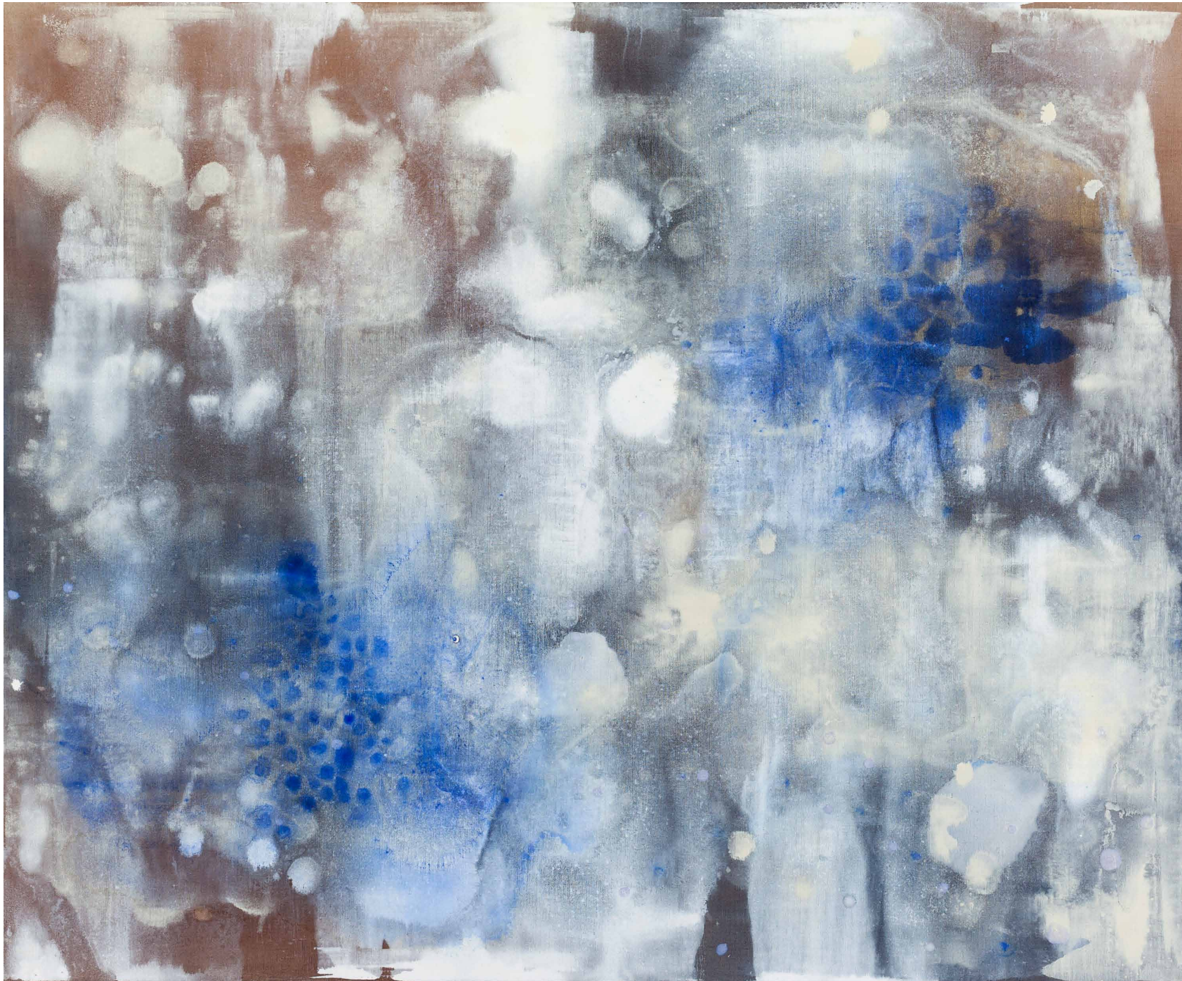
'Shield' 2016 mixed media on linen 84 x 102 cm $5,500 framed