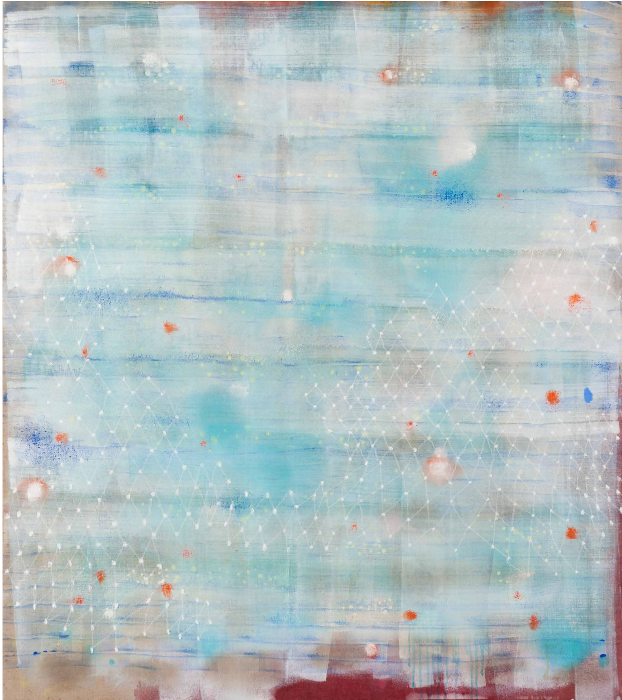
'Expanse' 2016 mixed media on linen 137 x 123 cm $7,700 framed