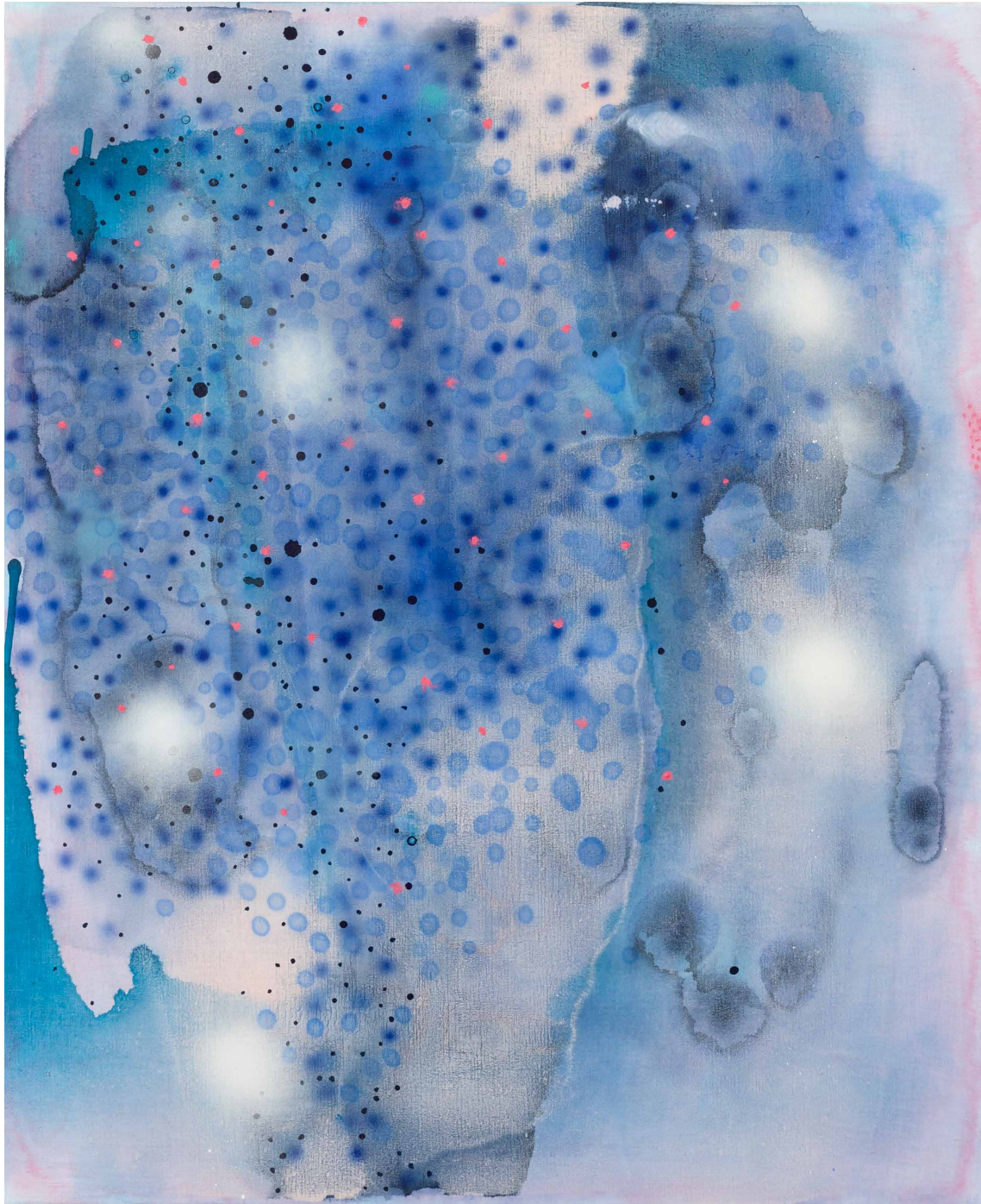
'Bubbling' 2016 mixed media on linen 108 x 83 cm $5,500 framed