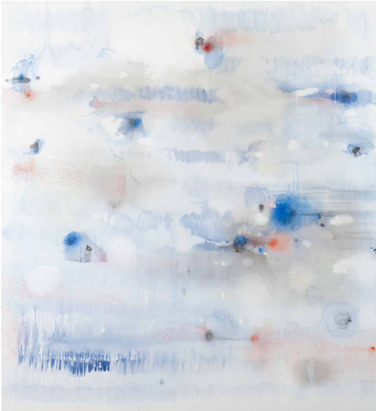
'Measure' 2016 mixed media on linen 153 x 137 cm $8,800 framed