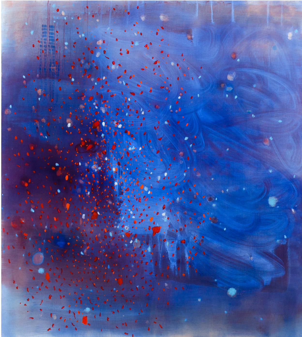
'Attraction' 2016 mixed media on linen 153 x 137 cm $8,800 framed