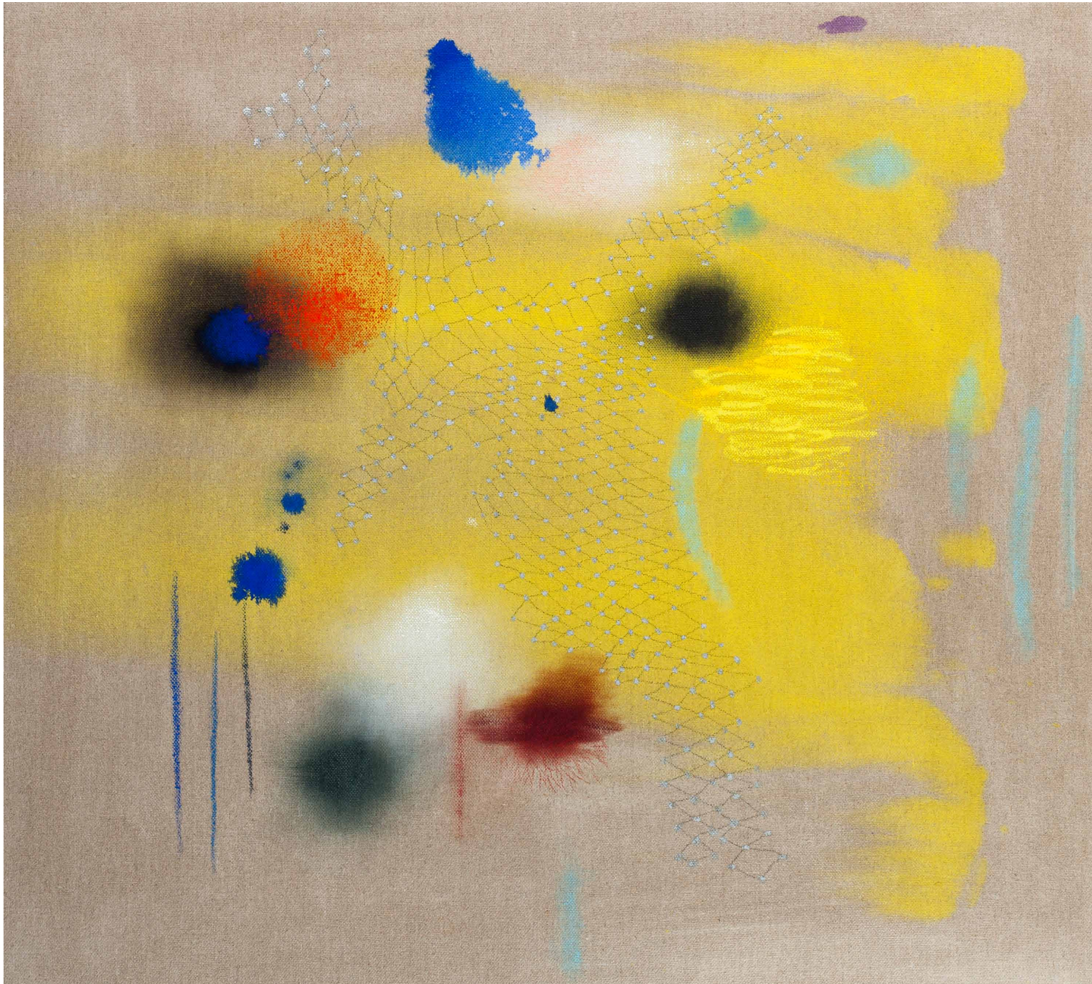
'Charge' 2016 mixed media on linen 153 x 137 cm $8,800 framed SOLD