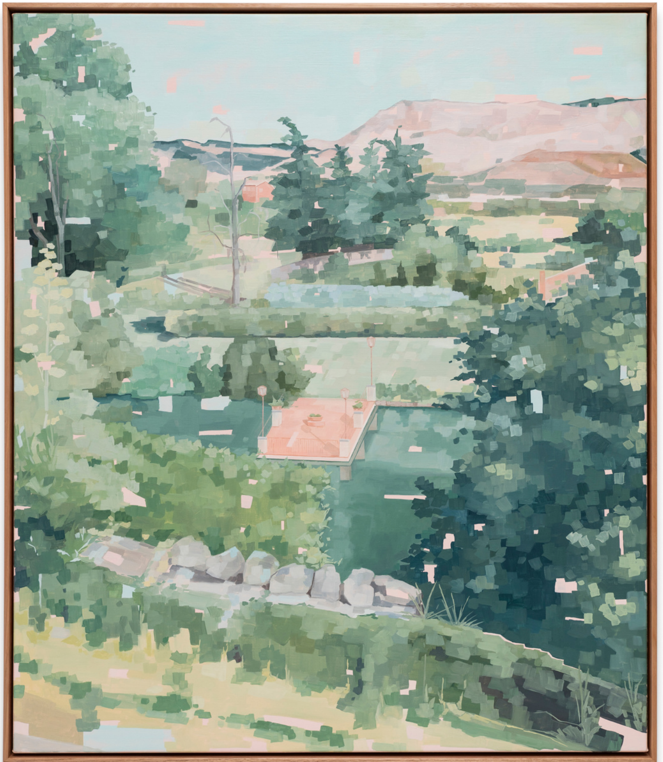
Castiglione Di Sicilia 2023 oil on linen 107 x 92 cm $5,800