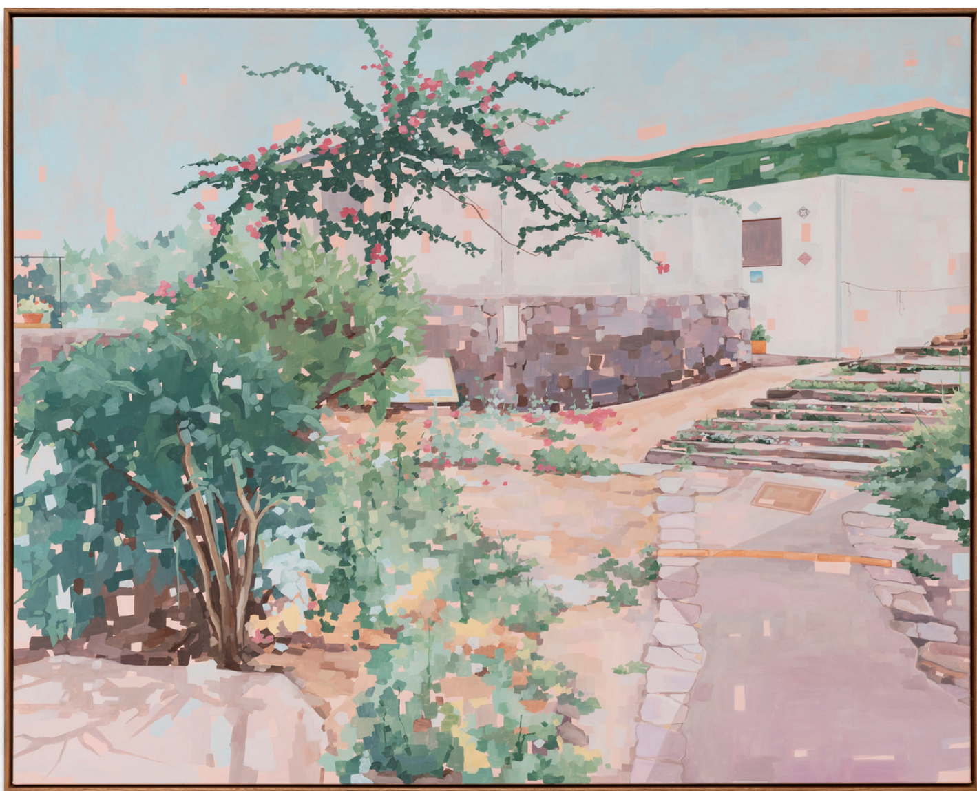
Salina 2023 oil on linen 122 x 152 cm $8,000