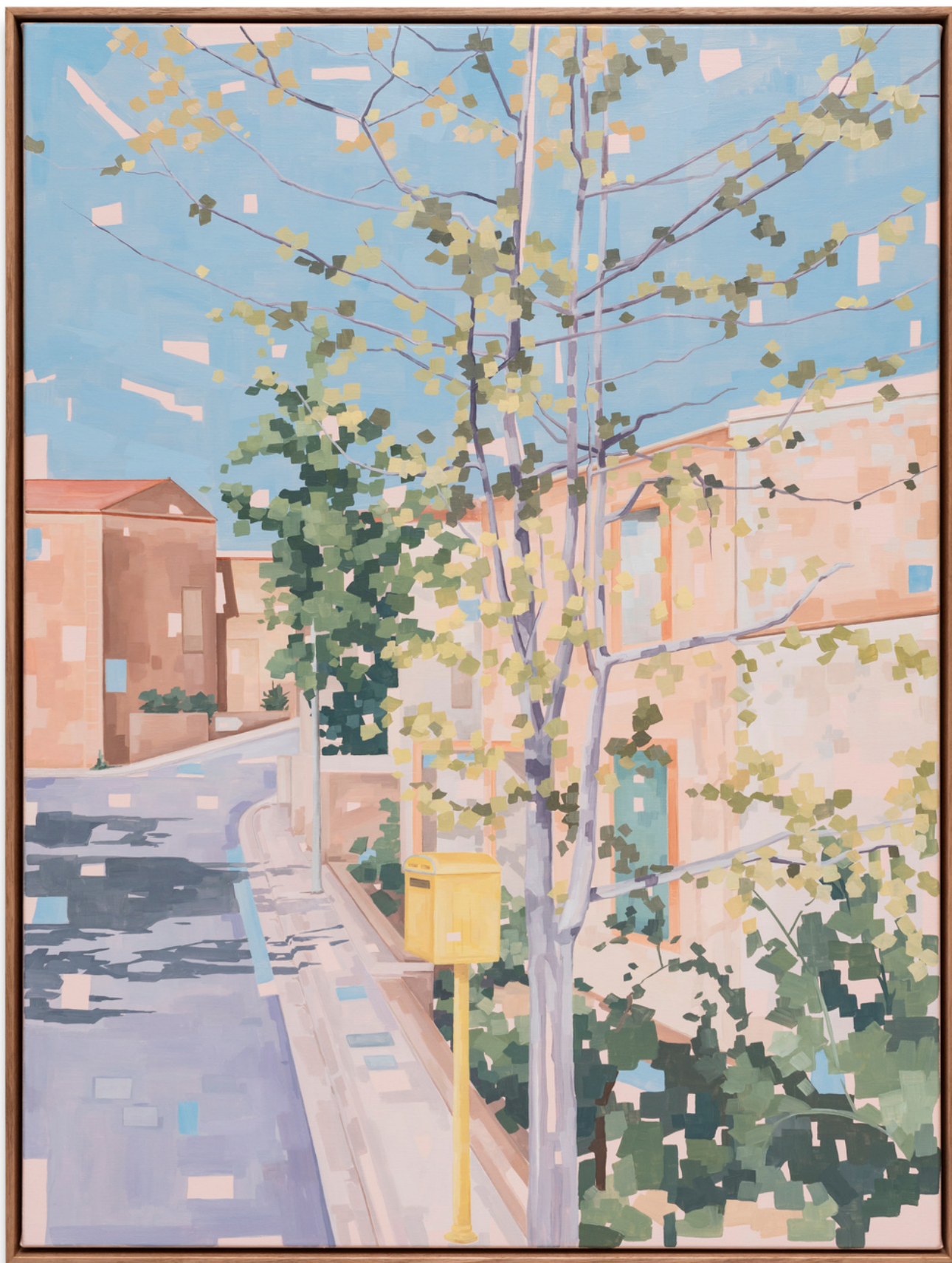
La Poste, Villespassans 2023 oil on linen 102 x 76 cm $5,200