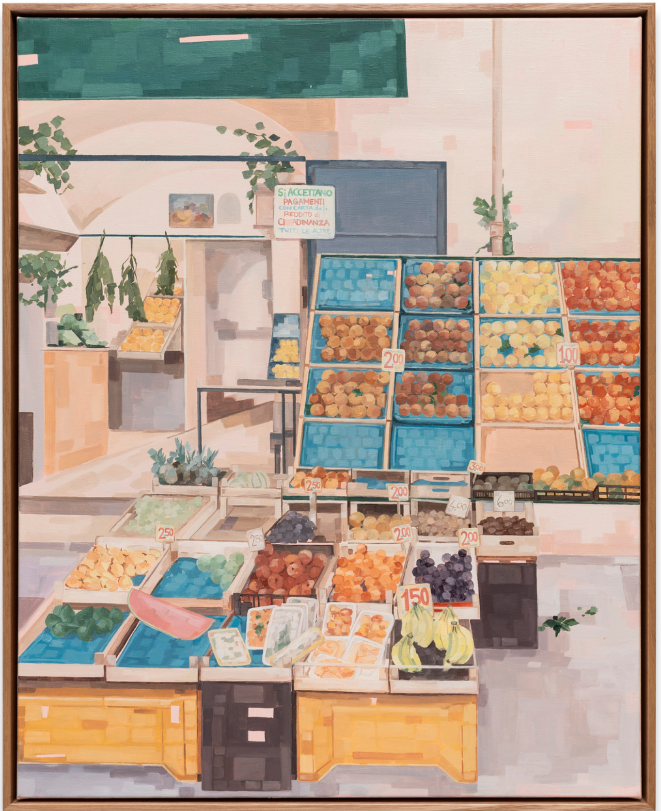
A Little Fruit Shop, Napoli 2023