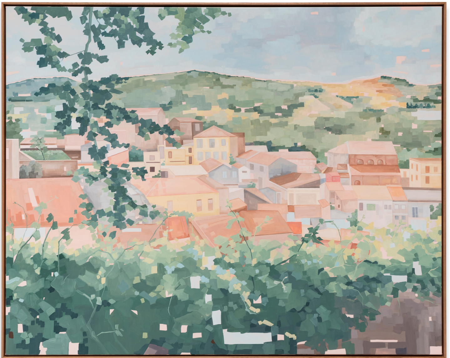
The Sleepiest Village 2023