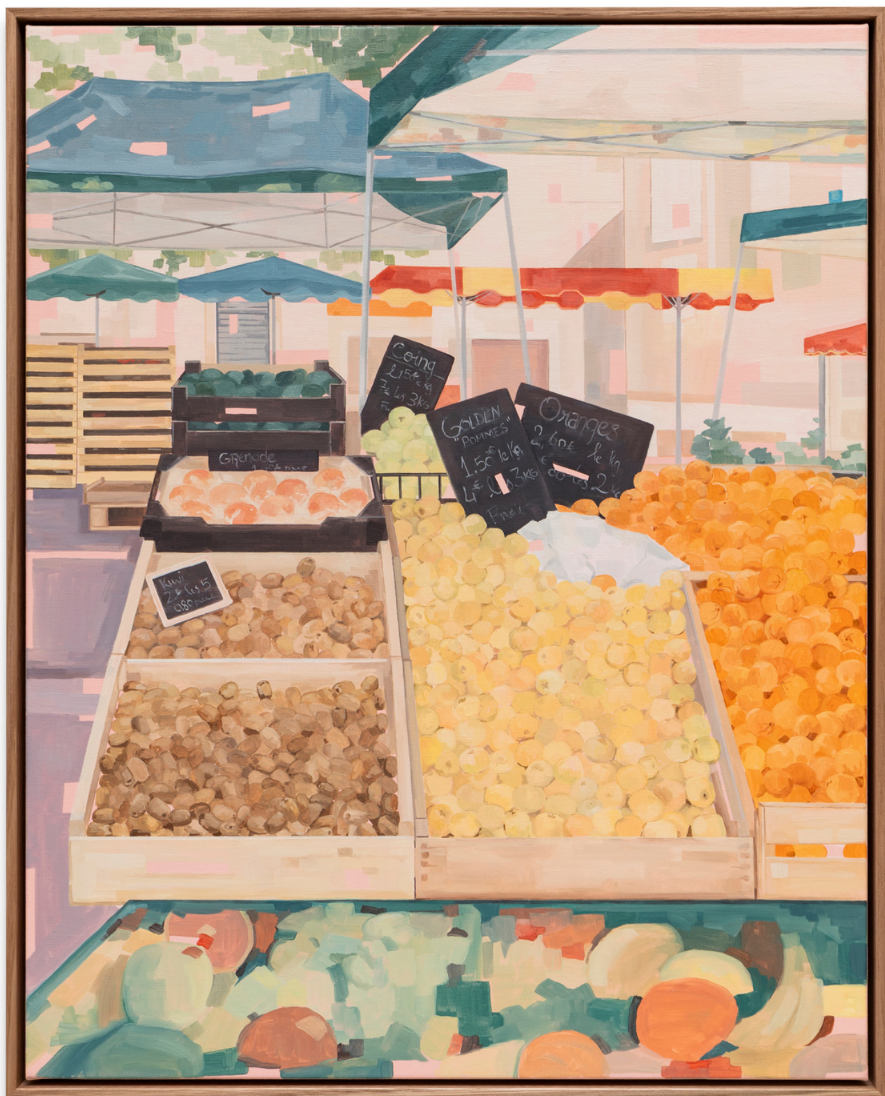
Saturday Market, Pezenas 2023