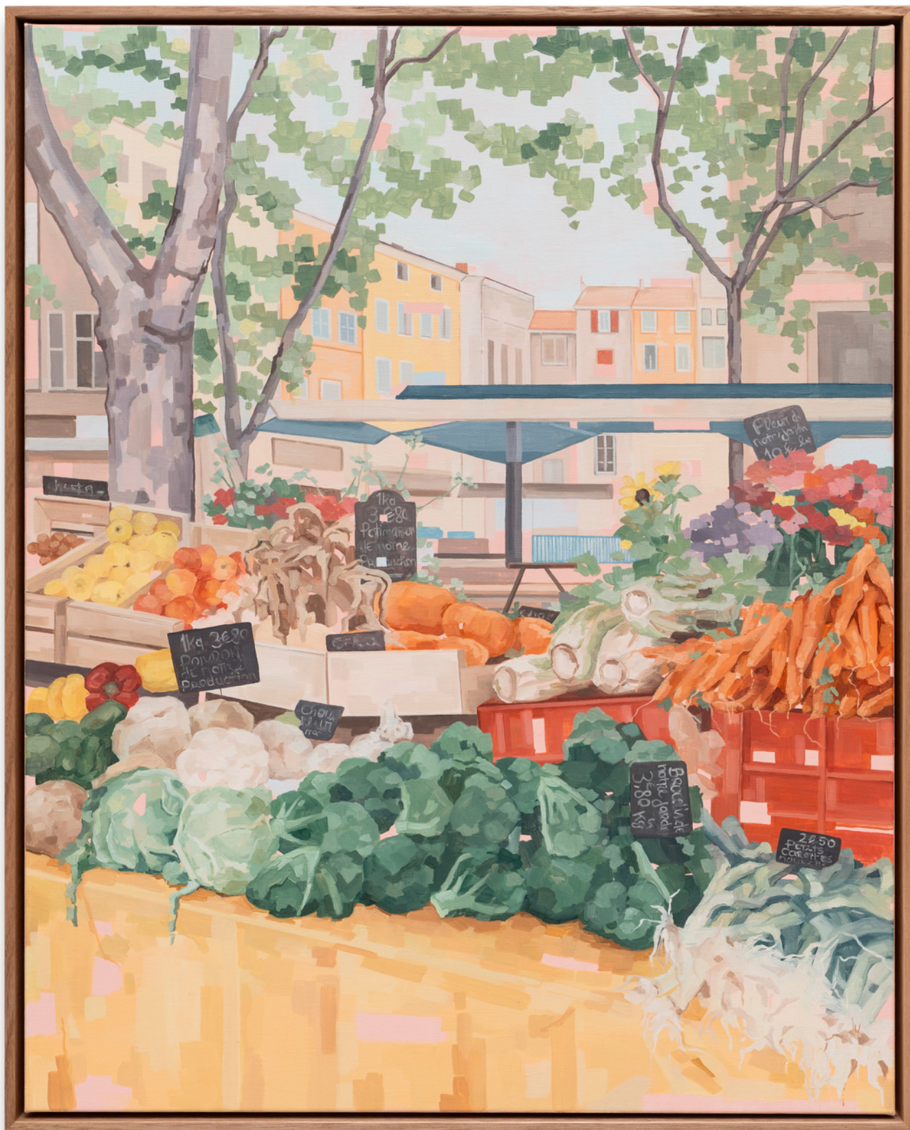
Sunday Market, Aix-en-Provence 2023