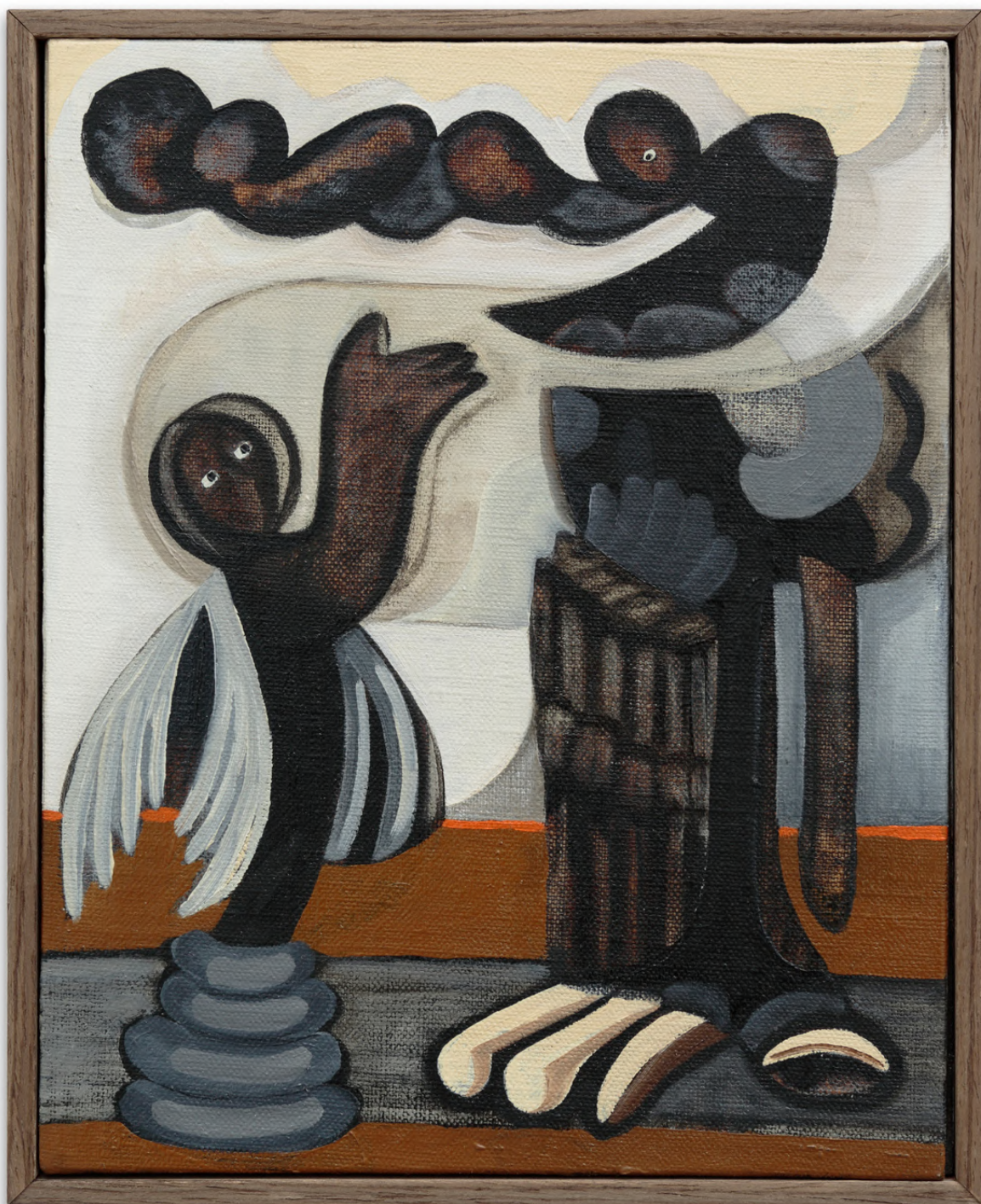
KIRSTY BUDGE I see dread people 2024 oil on linen board 27 x 22 cm SOLD