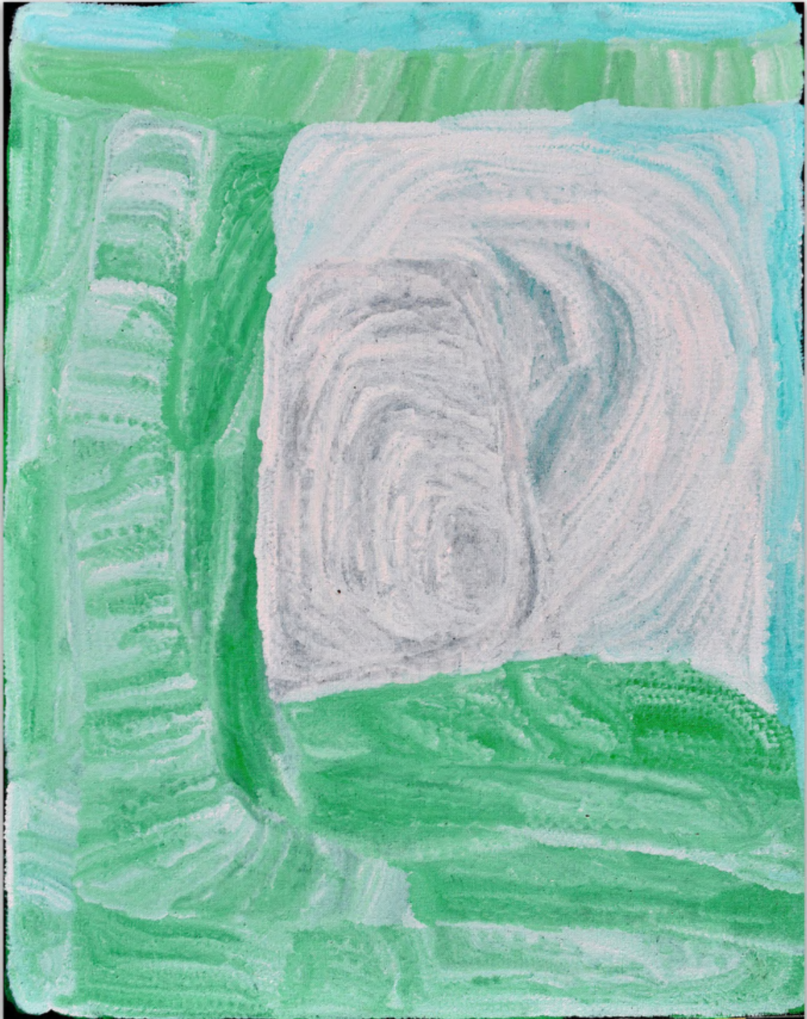
LYDIA BALBAL Martakulu 2023 acrylic on linen 114 x 88 cm Cat 841467 $6,700