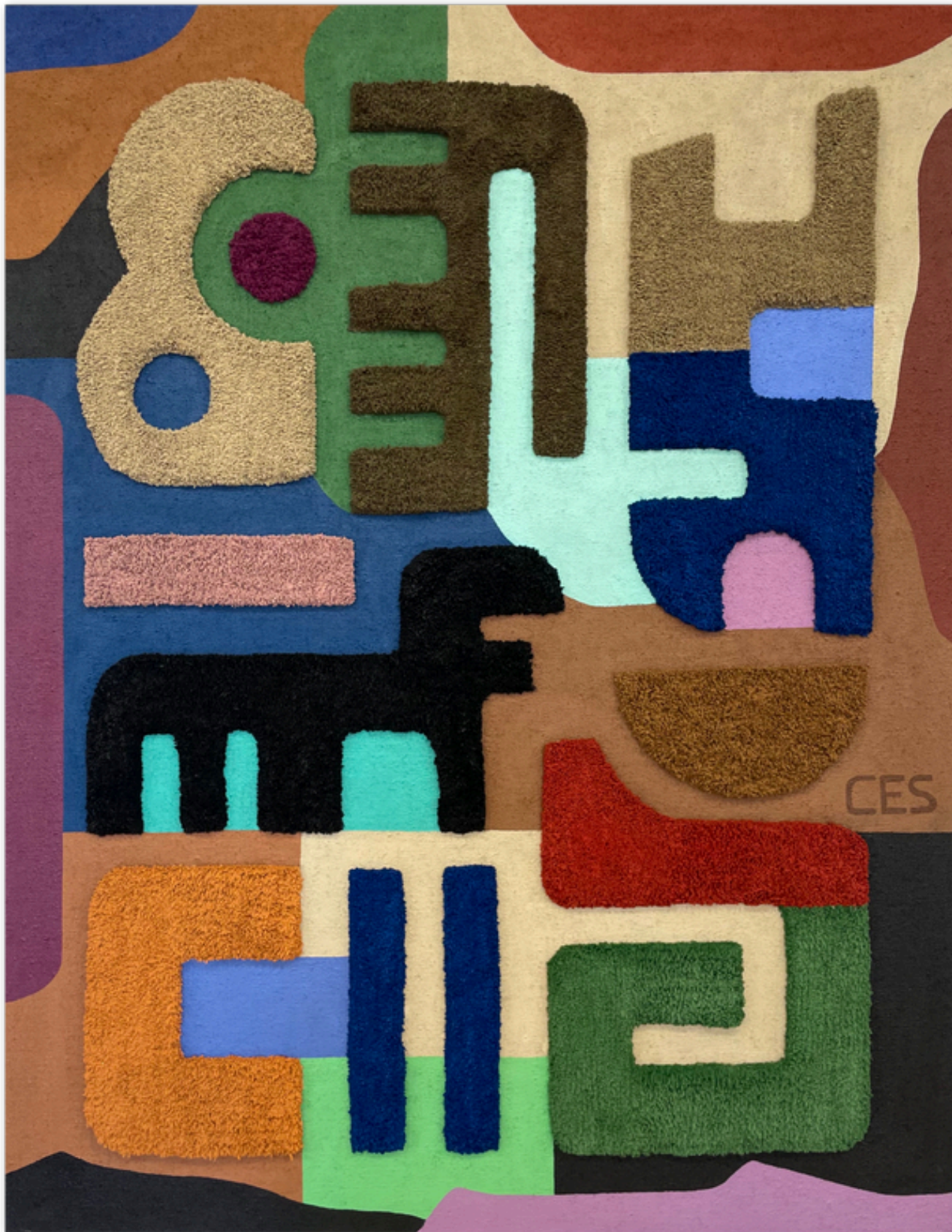
Composition (mauve with beast) 2025