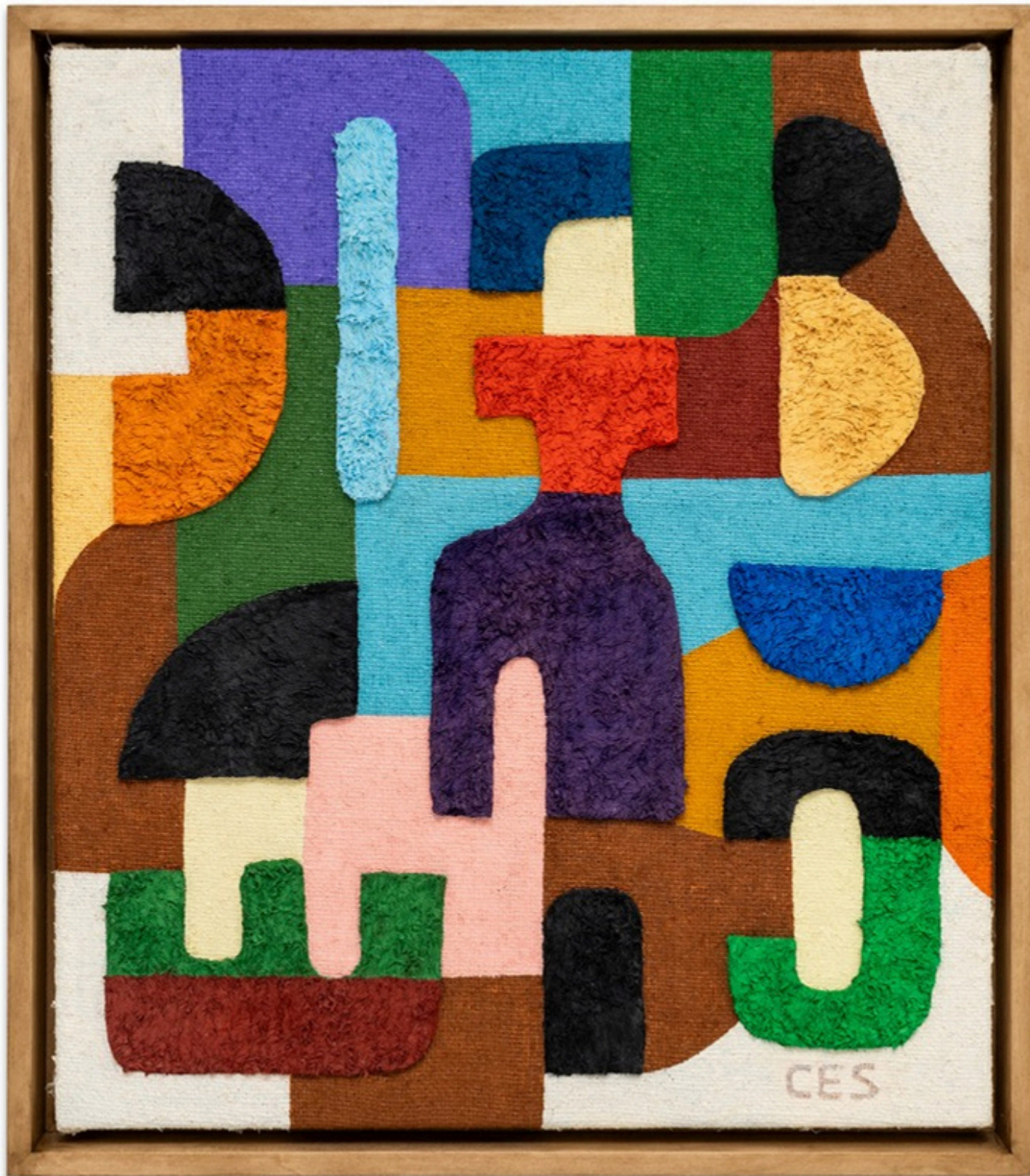
Petite composition (blue pole) 2025 acrylic on burlap and synthetic fibre 46.5 x 40.5 cm $3,500 framed