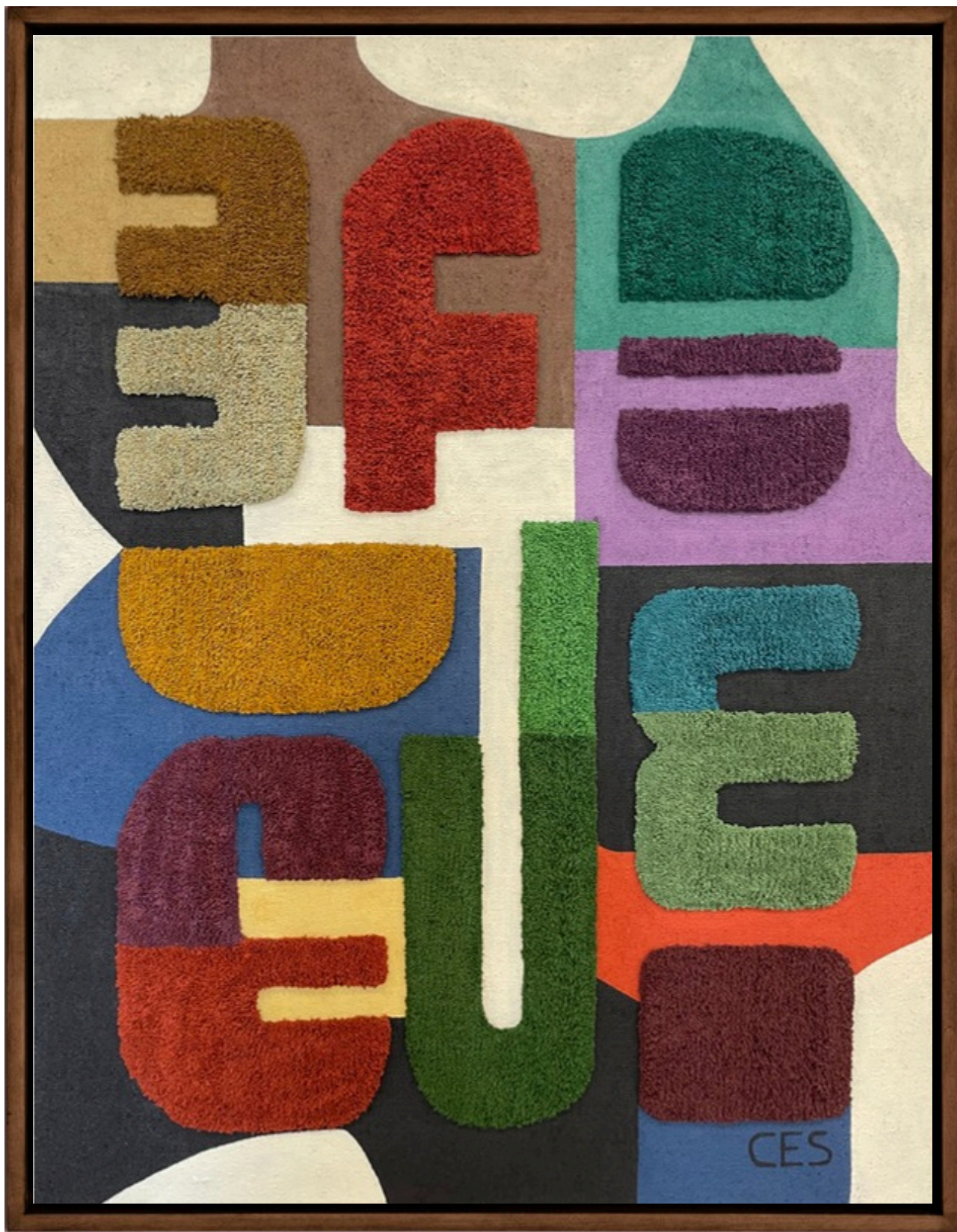
Composition (Sway) 2025 acrylic on burlap and acrylic wool 130 x 100 cm $14,300 framed