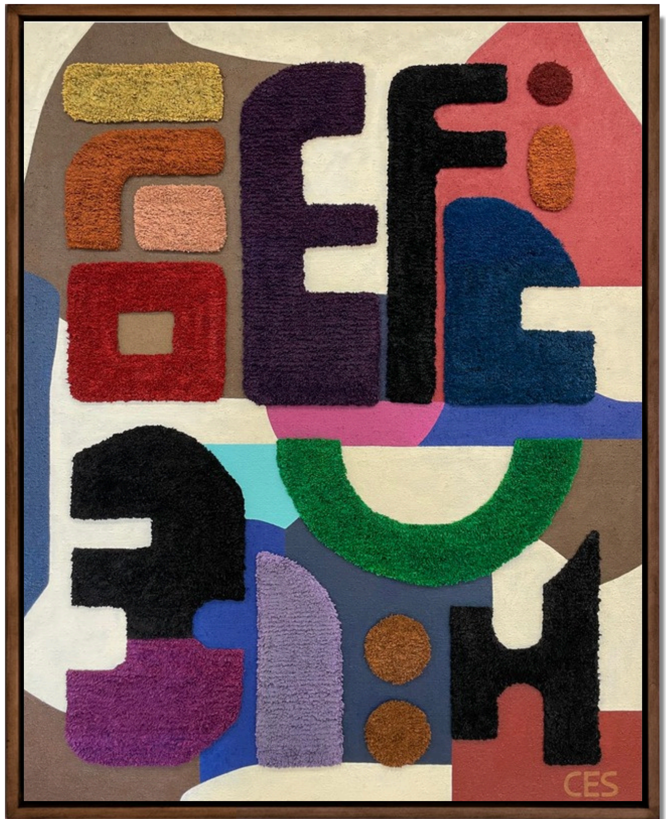
Composition (semi circ) 2025 acrylic on burlap and acrylic wool 140 x 110 cm $14,800 framed