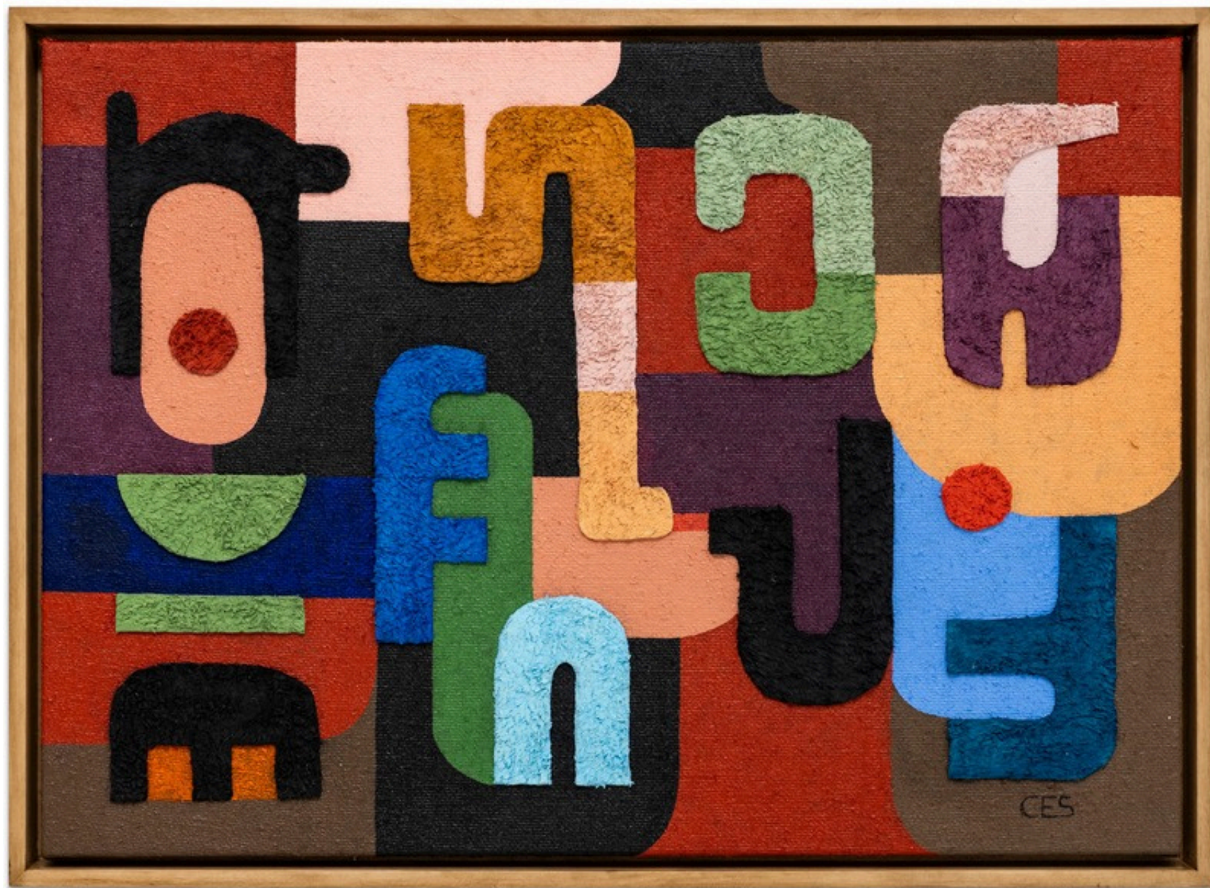
Petite composition (serpents) 2025 acrylic on burlap and synthetic fibre 50.2 x 70.2 cm $3,950 framed