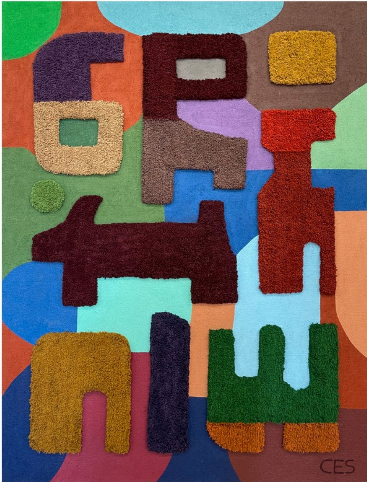
Composition (blue lake) 2025 acrylic on burlap and acrylic wool 130 x 110 cm $13,500